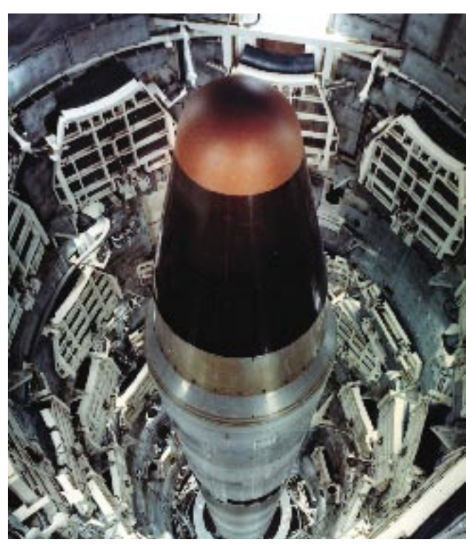
A Titan II sits in its silo. The last of this second generation version of Air Force ICBMs was removed from alert in 1987.