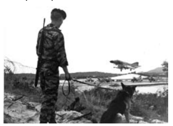
An F-4 lands at a base in South Vietnam under the watchful eyes of a security policeman and his dog. The theory was that if Vietnam fell to the communists, the other nations of Southeast Asia would also fall "like a row of dominoes."

July 30, 1970. Israeli Air Force shoots down five MiGs flown by Soviet pilots in Middle East "War of Attrition."