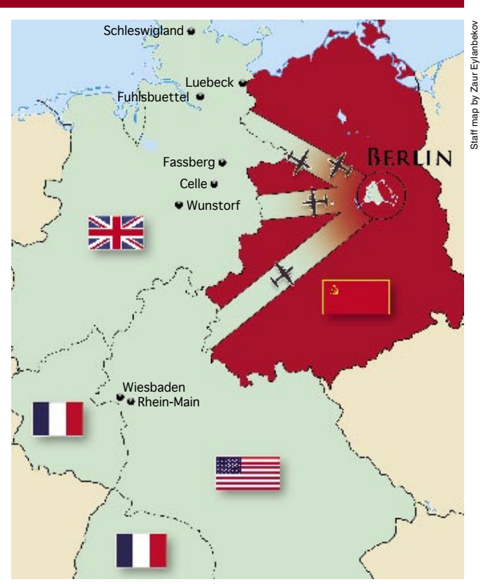
In 1948, when the Soviets blockaded the ground routes into Berlin, three air corridors, each 20 miles wide, remained open. The flags indicate the American, British, French, and Soviet occupied sectors.

Oct. 7, 1949. Communist-ruled German Democratic Republic (East Germany) established.