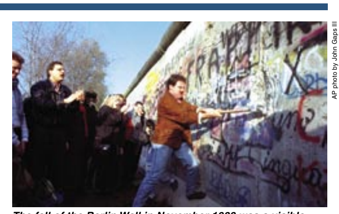
The fall of the Berlin Wall in November 1989 was a visible symbol of the fall of the Soviet Union, which formally ceased to exist two years later.

Dec. 26, 1991. The Soviet Union ceases to exist.