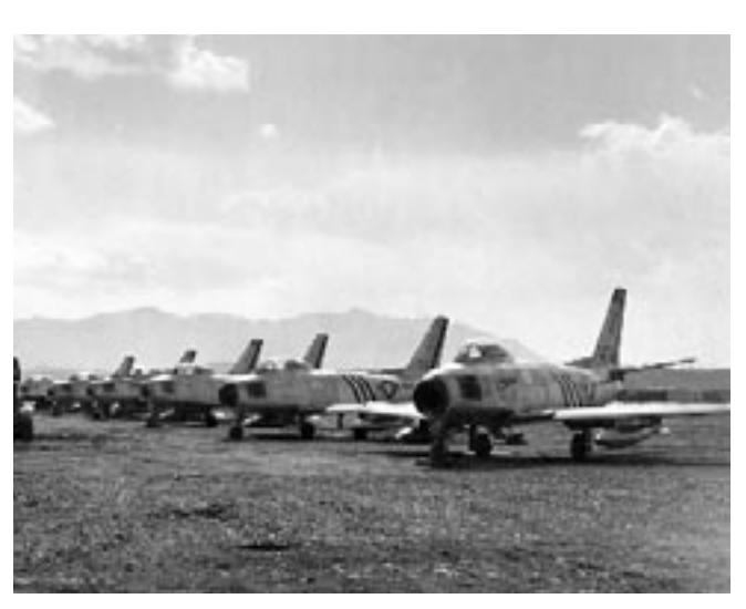
The US responded quickly to the invasion of South Korea in 1950, believing it was the beginning of a global communist offensive. USAF F-86 Sabres performed with special distinction.

Feb. 14, 1950. Soviet Union and China sign treaty of alliance and mutual assistance.